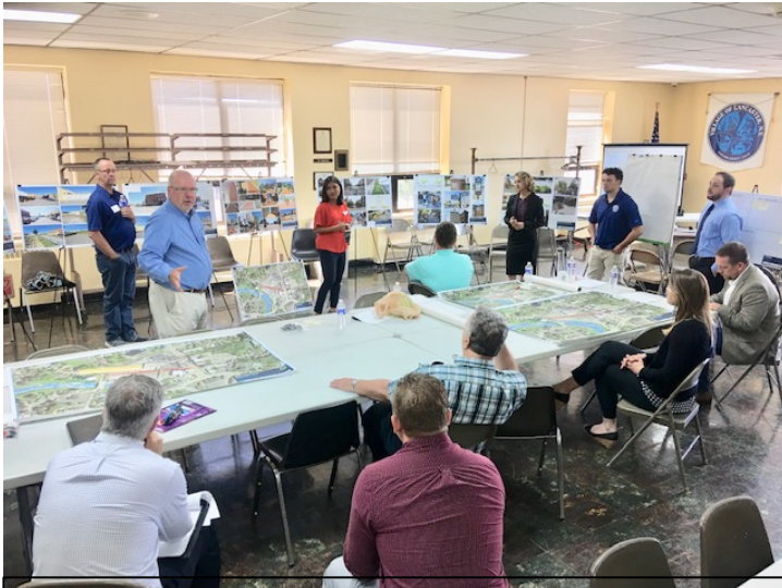
Stakeholder meeting for the West Main St. Extension project.