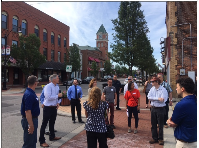
Site tour with Wendel - part of the West Main St. Extension project

The goal for the West Main St. Extension project is to create a new pedestrian-friendly, walkable, and bike-able extension of the village downtown, which will facilitate new opportunities for mixed-use development in the next 3-5 years and an ADA-compliant thoroughfare. In October 2018, Governor Andrew M. Cuomo announced that the Village of Lancaster was one of four Western New York communities that were selected to receive Smart Growth Community Funds in the amount of $2.5 million from the Buffalo Billion II initiative. The engineering firm, Wendel, was selected. Stakeholder meetings recently took place to catalyst initial design drawings which will be taken to the public for feedback this summer. Construction is anticipated to start in the Spring of 2020.